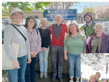
Supporters on our walk during the Week of Vision and Prayer!