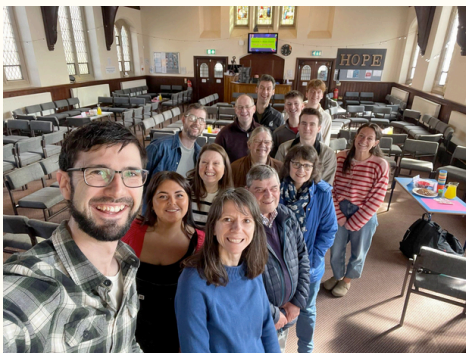
Some of the helpers for the Ripley Alpha Day last term!